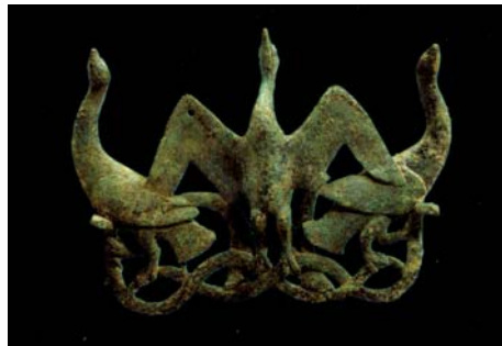
Bronze hanging ornament cast in a shape of three water birds, before BC100 found near Chengjiang