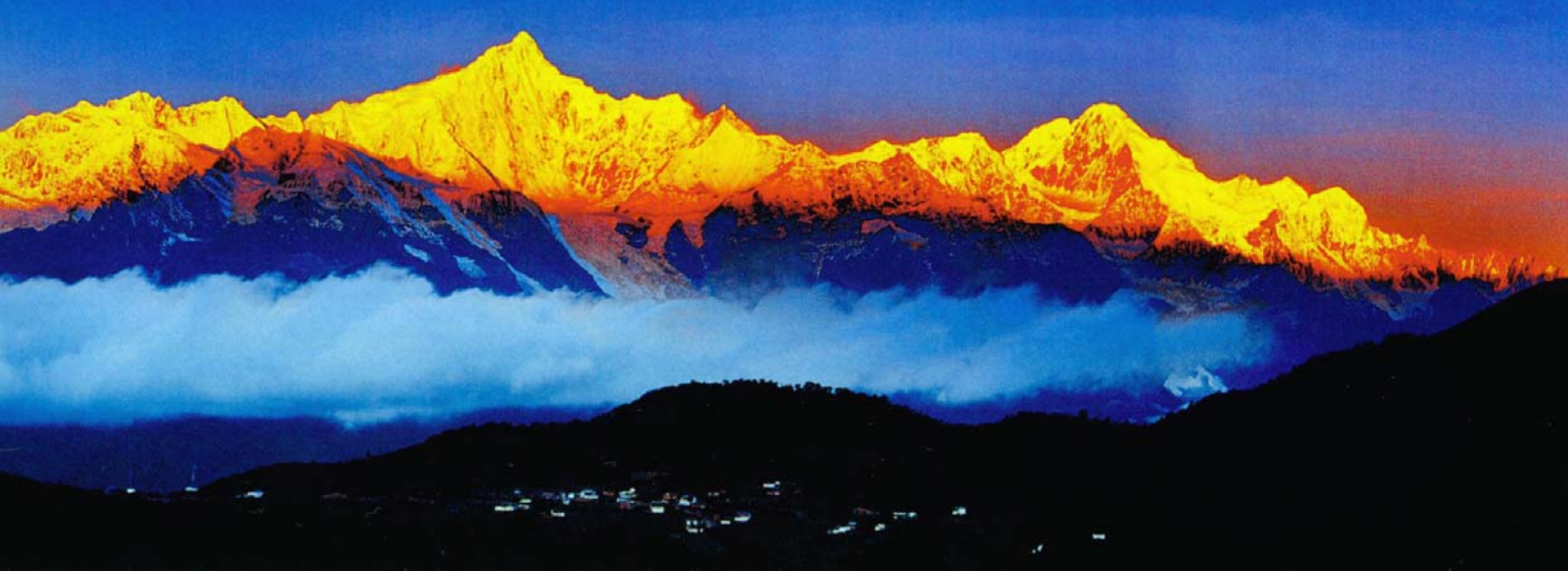
Meili Mountain, 6740m, No one can reach its peak.