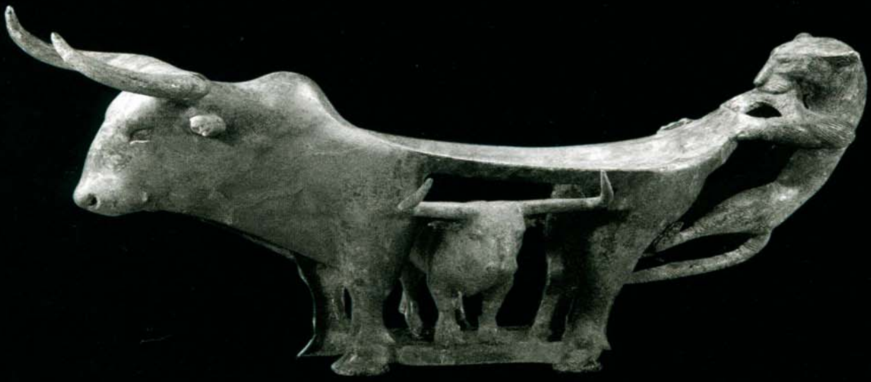
Bronze table of Dian Kingdom, before BC400